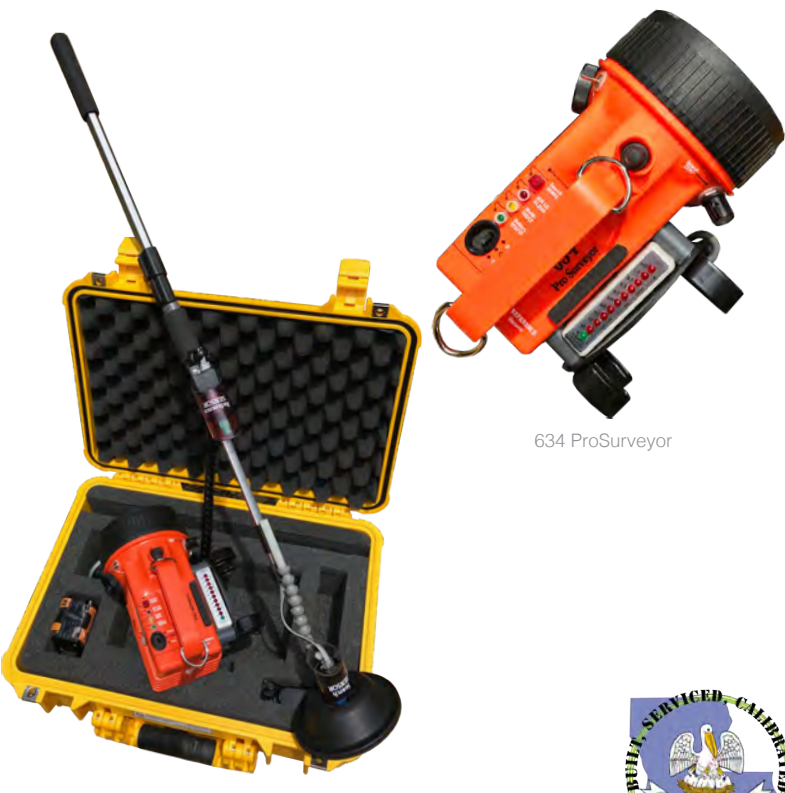
634 ProSurveyor Kit with Optional Pelican Case